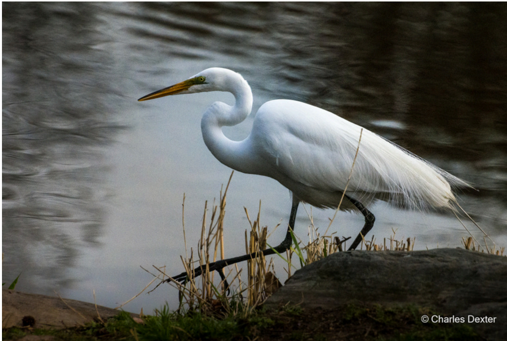
Untitled © Charles Dexter