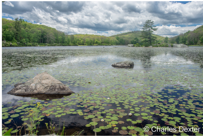
Bear Mountain © Charles Dexter