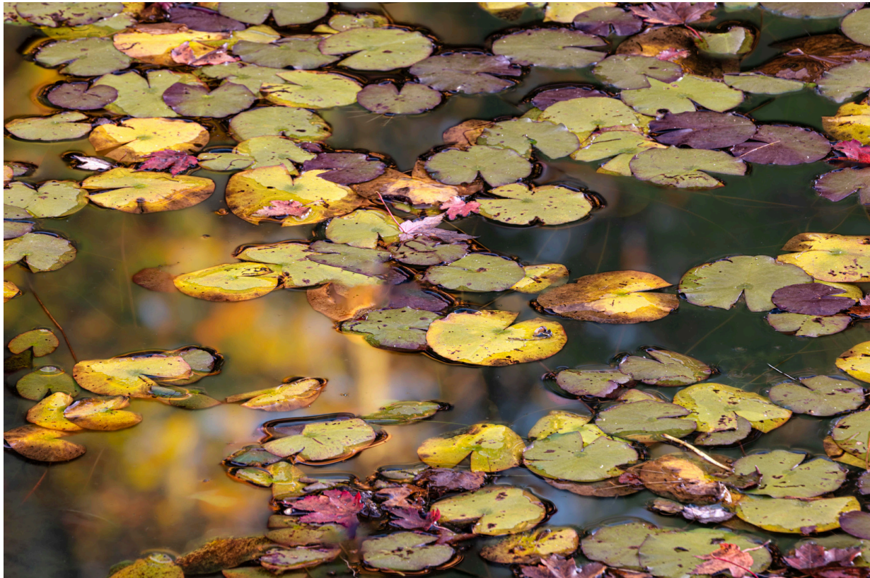
Lillypads