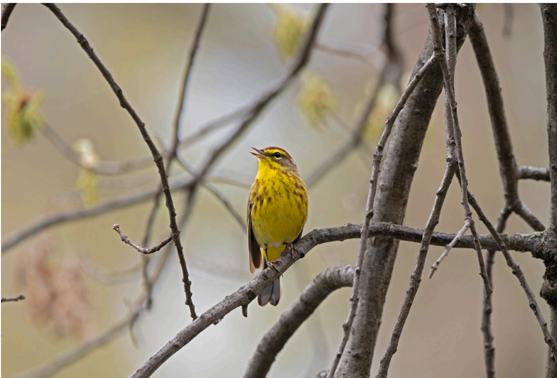
Palm Warbler The Pool

If you will be exhibiting any of your work soon, please email the exhibition information to info@sierraphotony.com for it to be added to this section of our newsletter.