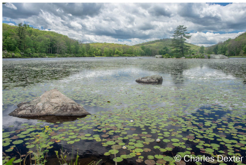
Bear Mountain