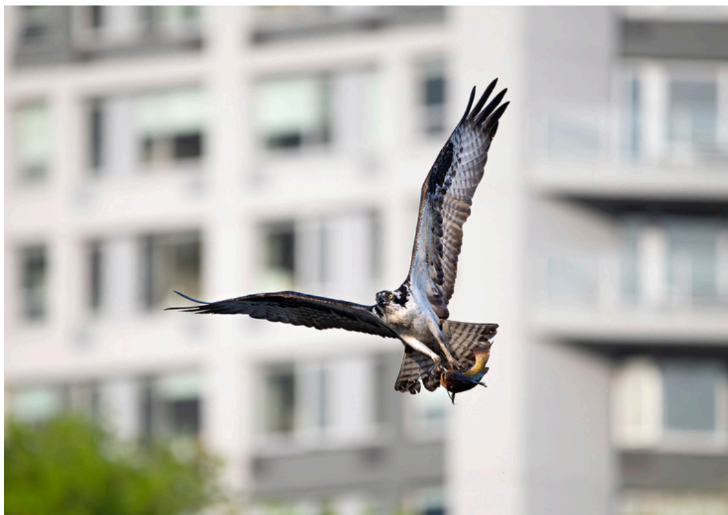
Osprey Harlem Meer

Meet at 4 PM at the West 81 st Street entrance, north of the 79th Street Transverse. NYC Subway to 81 St-Museum of Natural History Station C, B. Bus: M10, M79. Bring water, walking shoes and rain gear. Dinner in the neighborhood afterwards.