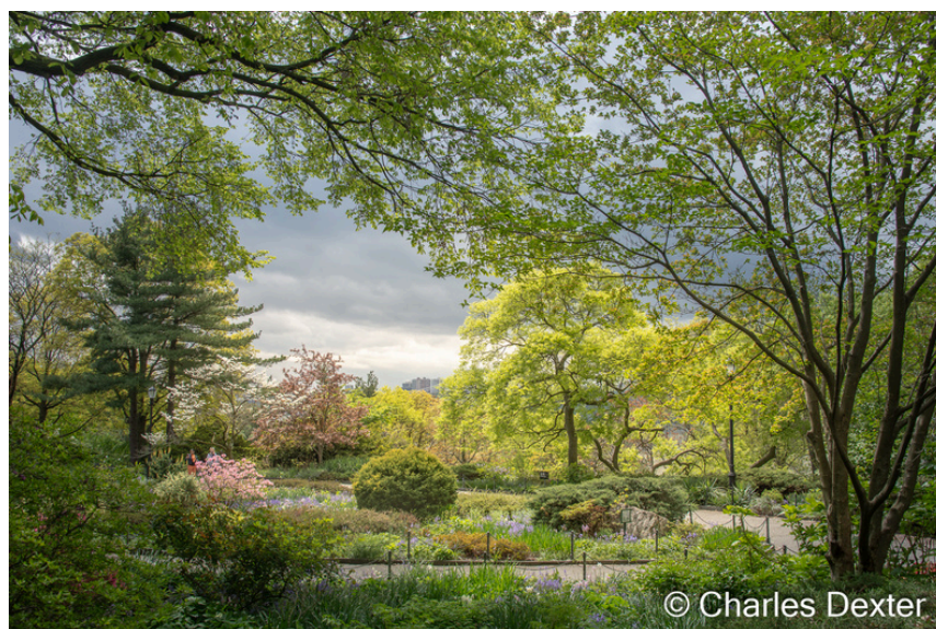
Fort Tryon © Charles Dexter