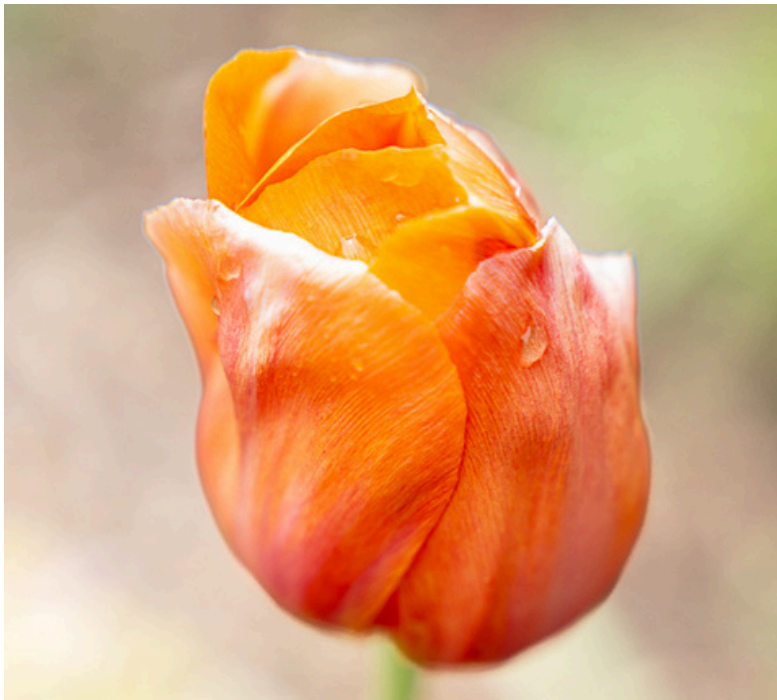
Untitled