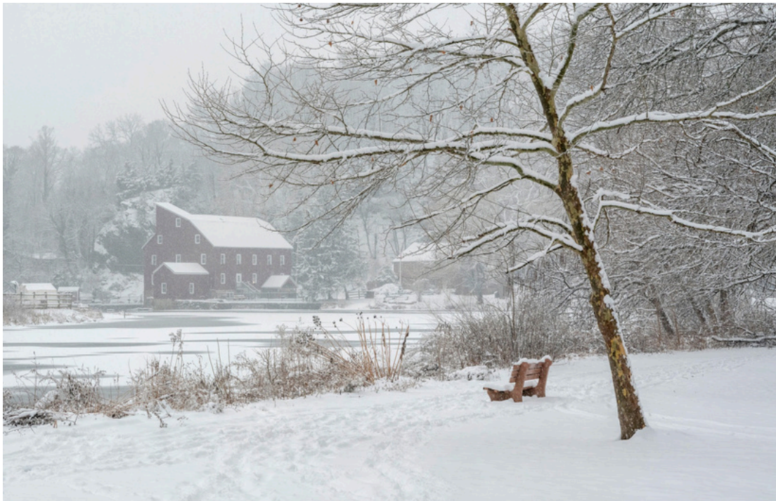
Footsteps in the Snow