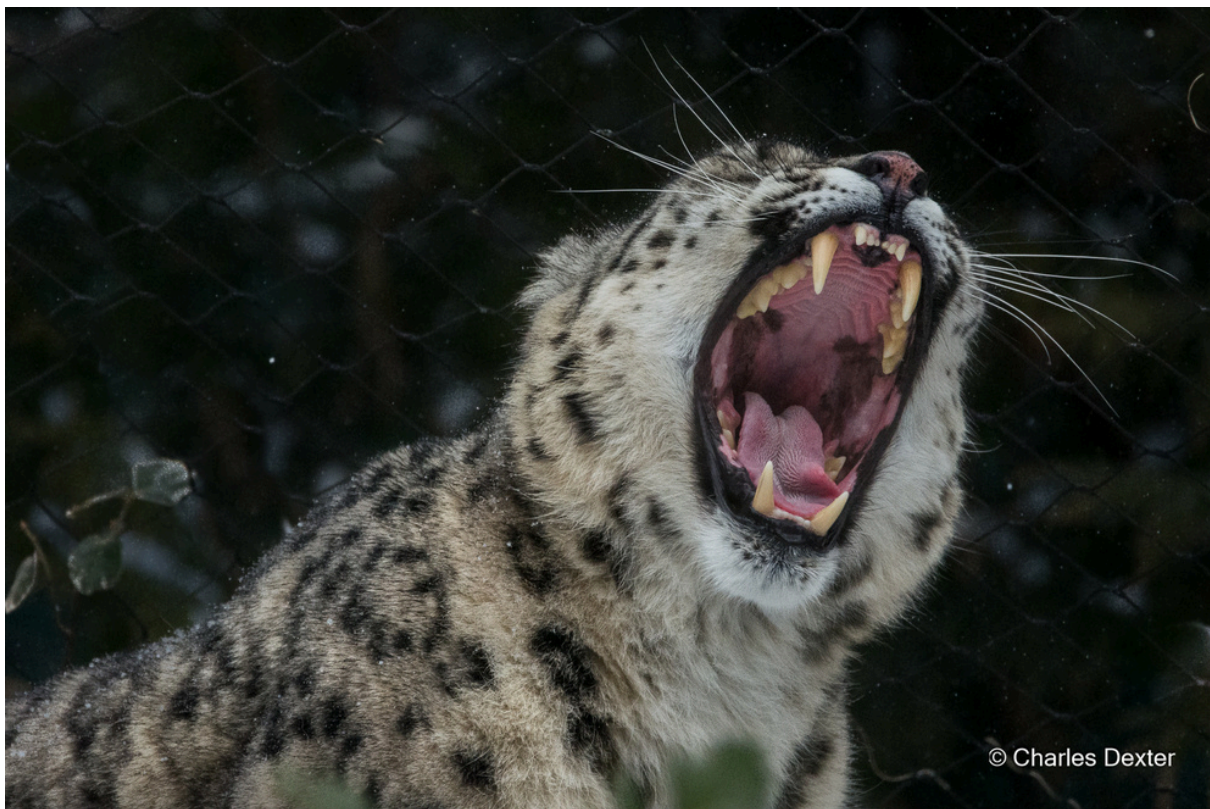
Central Park Zoo

If you will be exhibiting any of your work soon, please email the exhibition information to info@sierraphotonyc.com for it to be added to this section of our newsletter.