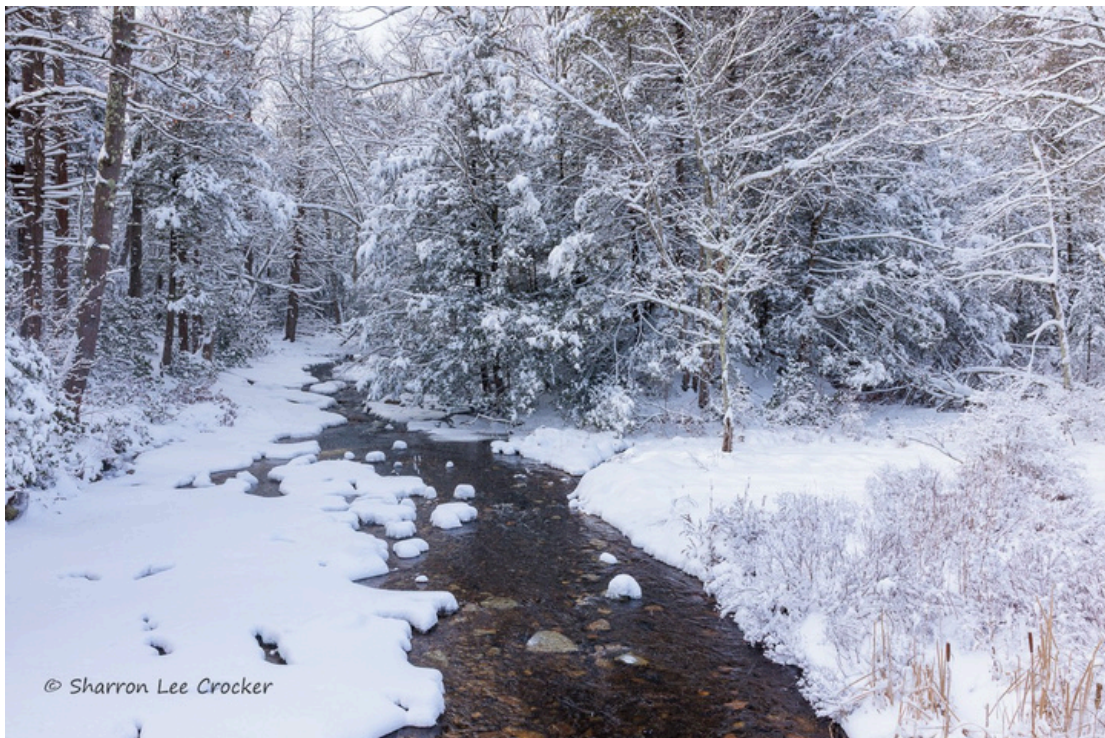
Just A Touch of Winter

Earlier this year we created a new eventbrite page for Sierra Club Photo NYC. We encourage everyone to follow our page HERE to be sure you are notified every time a new event is created.