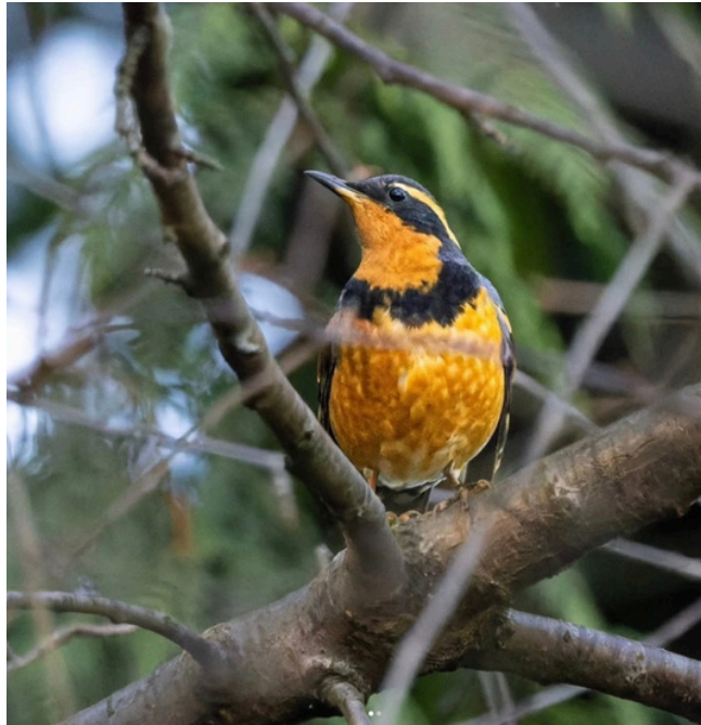
Varied Thrush © Benito Sim