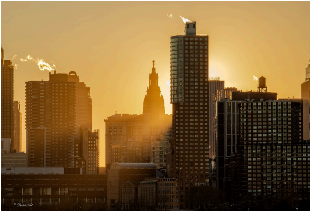
New York City Hall