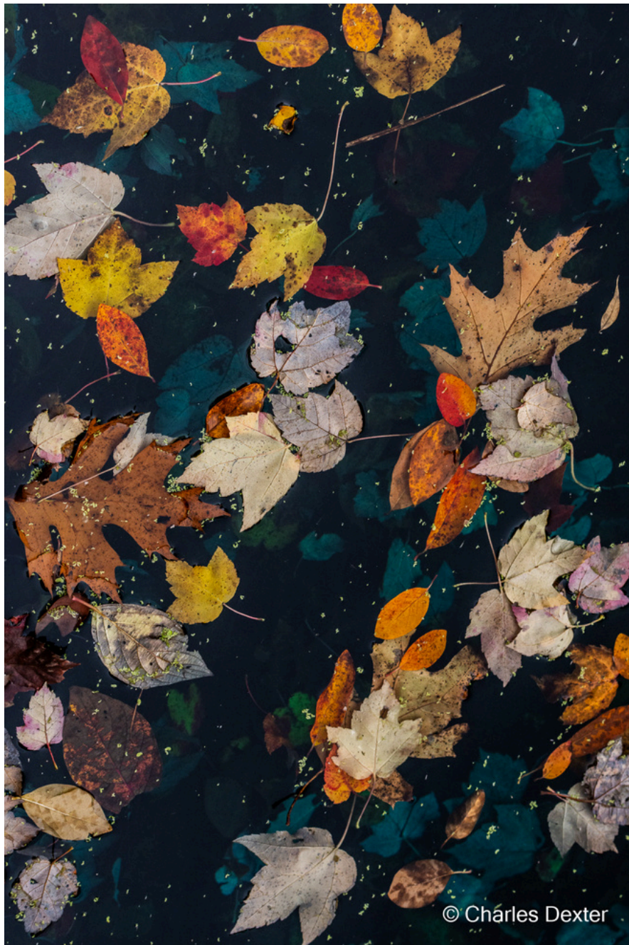
Mother of Pearl

One of the big takeaways from our members survey was an interest in conservation. So we are excited to announce a new section of our newsletter. If you are part of a local conservation group and would like to share the work you do with other Sierra Club Photo NYC members, please email the information to info@sierraphotonyc.com so it can be added to this section of our newsletter.