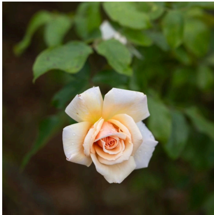
Mother of Pearl © Benito Sim

Ferry Round Trip Explore Battery Park, lower Manhattan and ride the Staten Island Ferry out and back. Photograph late afternoon city skyline & harbor views. Dinner in NYC afterwards. Meet: 12:45 pm outside the Whitehall – South Ferry Subway exit (N, R and W trains) in front of the Staten Island Ferry Terminal at Whitehall and South Streets. Google Map Link The Staten Island Ferry: Website