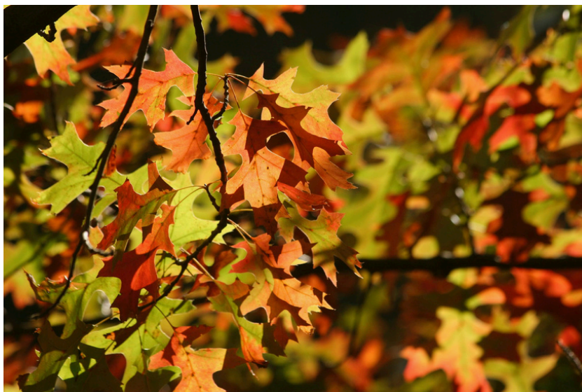
Autumn in Central Park

Unless otherwise noted, all meetings, including in-person ones, are broadcast via Zoom. On the meeting date, Eventbrite sends two emails to ticket holders: one two hours before and another at the start time, both with the meeting link. Be sure to sign in to your Eventbrite account in advance. Meetings start at 6:30 pm, with the presenter beginning at 7:00 pm. For in-person attendance, present your Eventbrite confirmation email upon arrival.