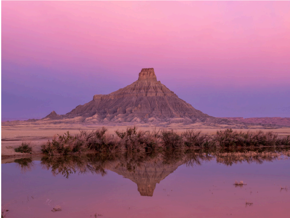
Utah Sunrise © Miroslav Vrzala