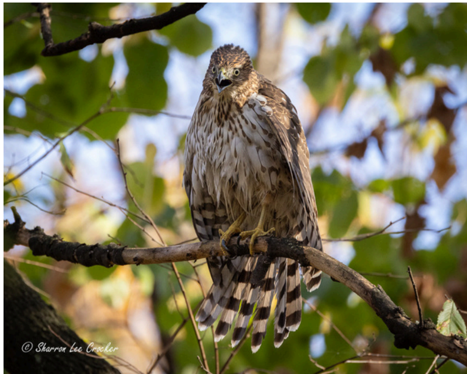
A Rather Noisy Coopers Hawk

Sierra Photo NYC does not have a membership program and we do not charge membership fees, as we are a subcommittee of the Sierra Club . However, we kindly request a donation to attend our speaker events, which helps cover our operating expenses. Our photography field trips are free and open to everyone. While we encourage all of our members to be Sierra Club members, it is only required if you would like to participate when we organize photo exhibitions.