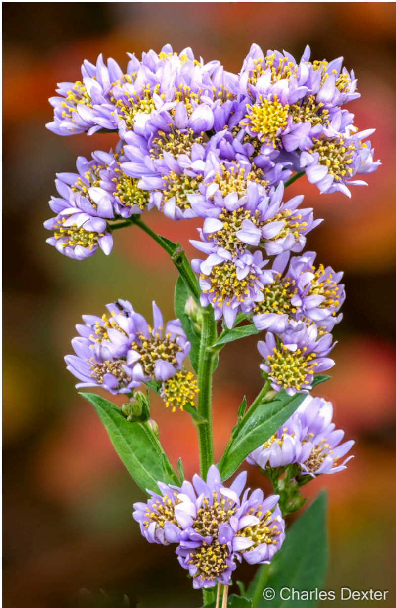
A Tartarian Aster Blooms

Stay Tuned for more 2025 outings soon to be announced!