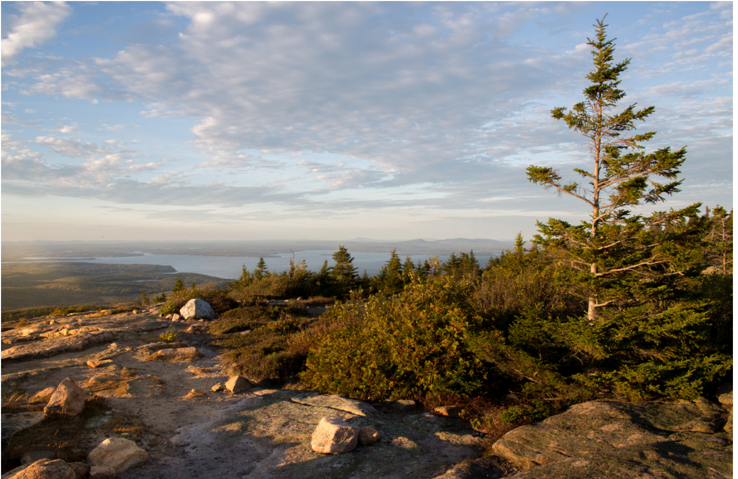
Acadia National Park

Wednesday, September 27 (in person): Members' Night