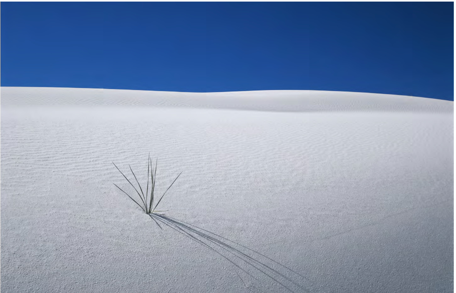
White Sands 1102-02. A young yucca plant at White Sands National Park in New Mexico. (Hasselblad 500CM / Zeiss 80mm f2.8 lens; Fuji Velvia 50 film).

FACEBOOK: https://www.facebook.com/carlos.esguerra.92