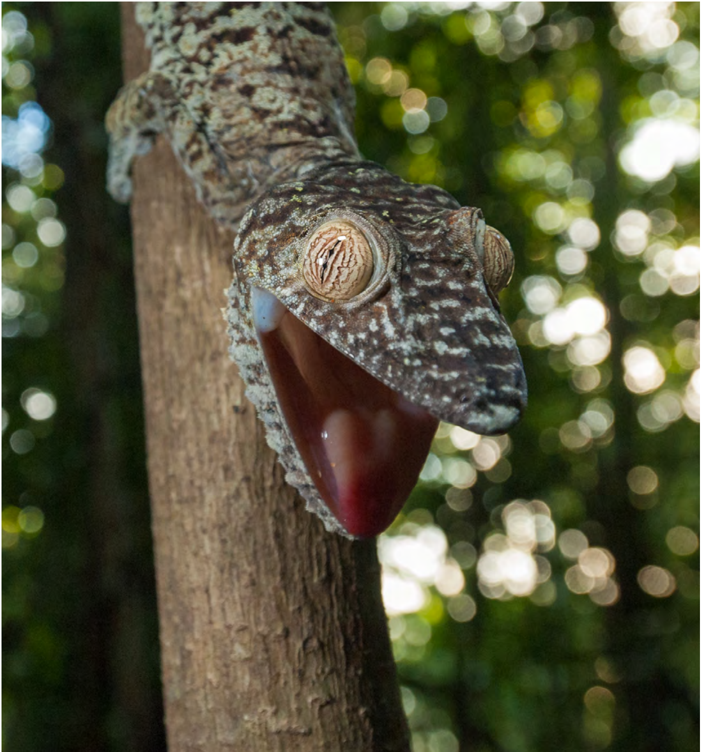
Leaf Tailed Gecko