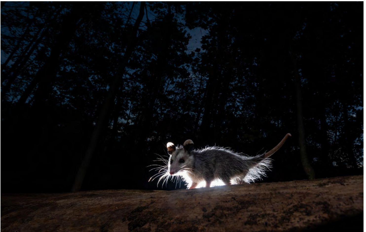
Backlit Opossum

See Sean's presentation details and biography on Page 9 .