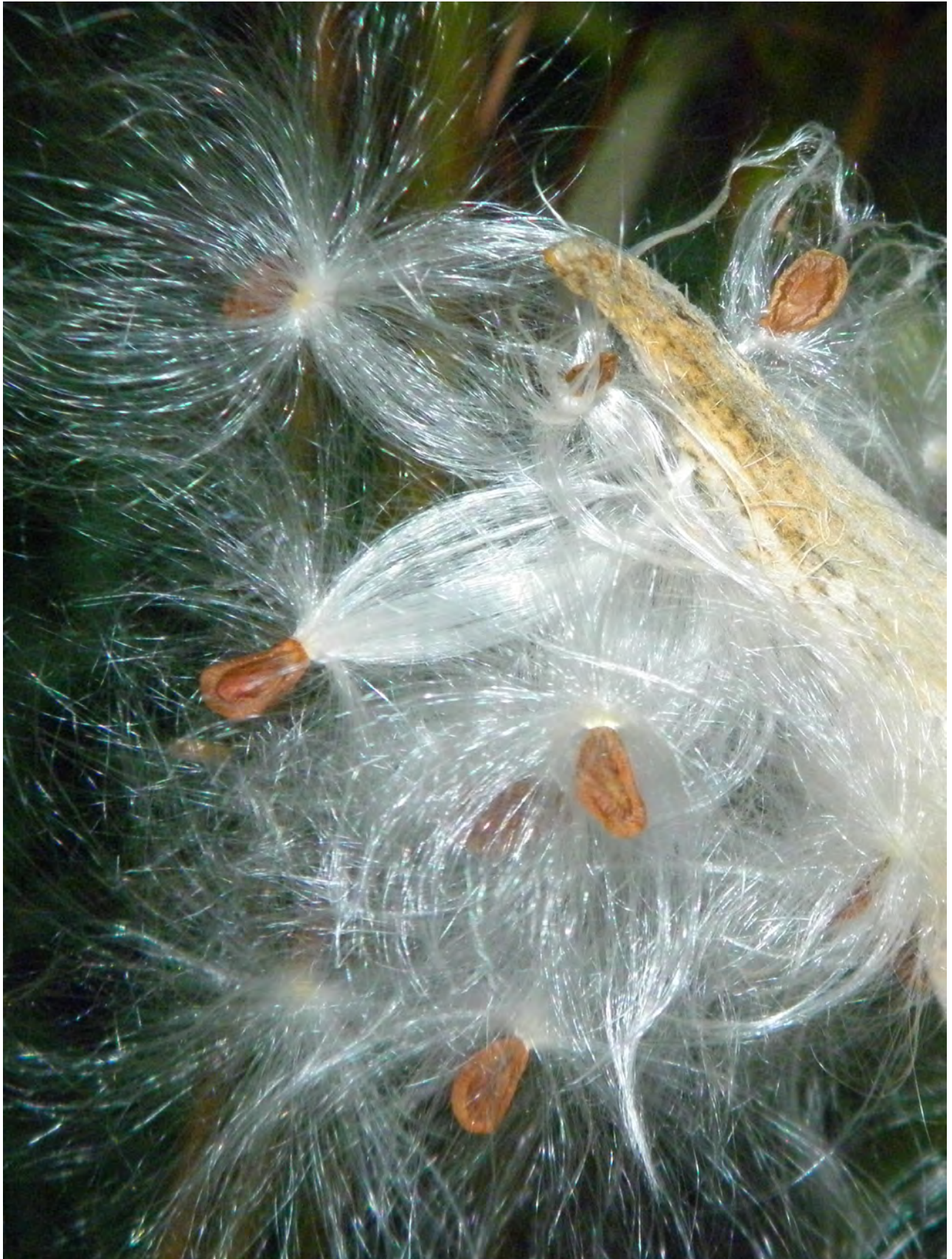
Milkweed Seeds