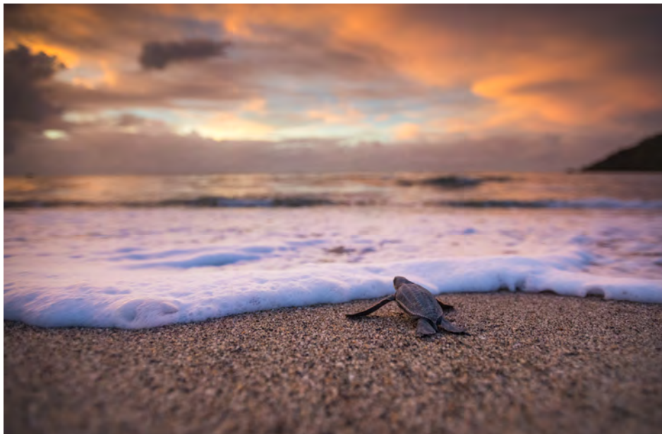
Leatherback Hatchling

LINKEDIN: https://www.linkedin.com/in/sean-crane-9099796/