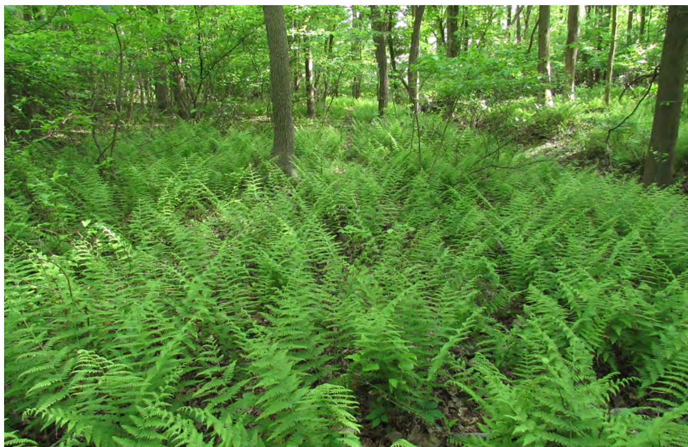
Ferns