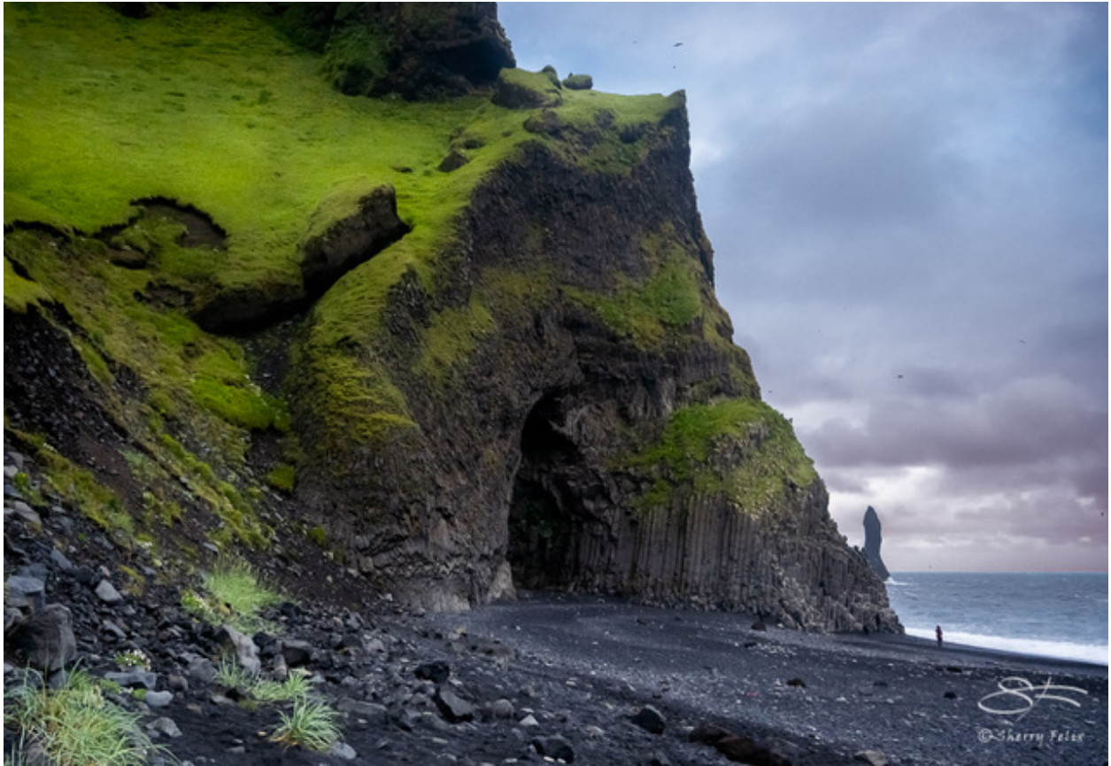
Iceland (2021)