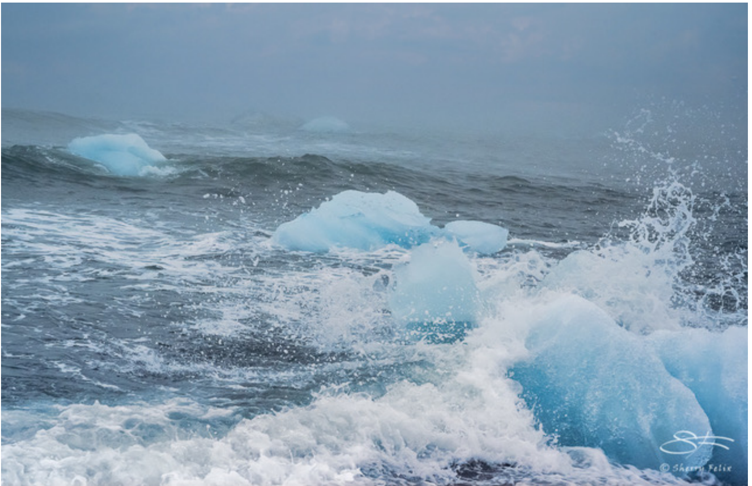
Iceland (2021)

For additional photos of Iceland see port4u.net under the category Iceland – port4u.