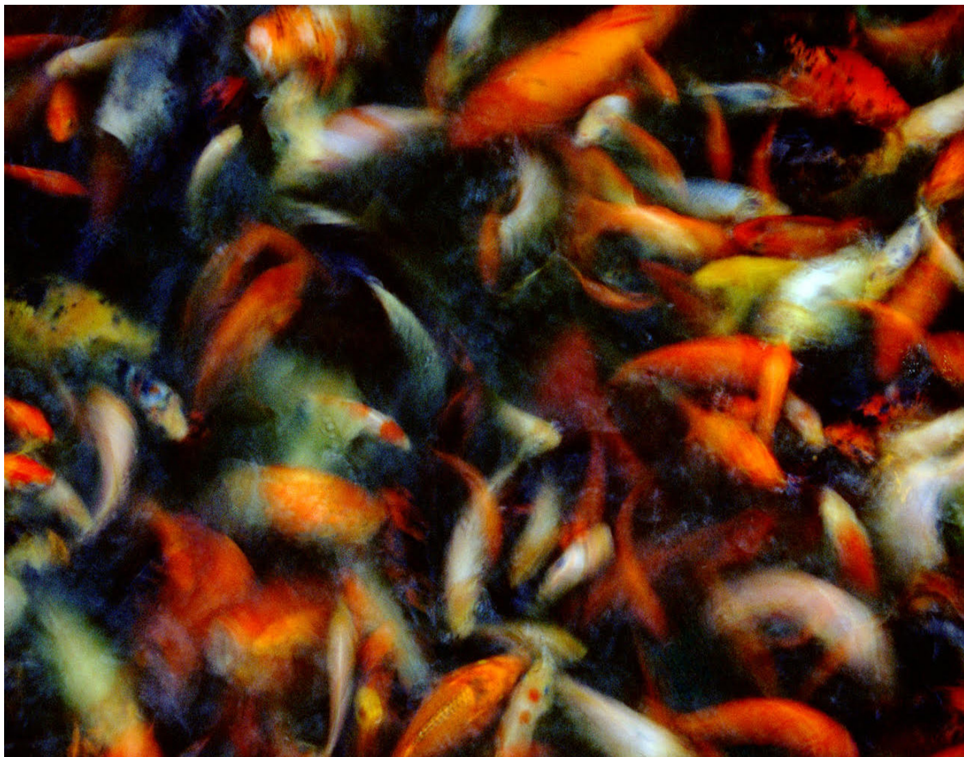
Fish! - Slow shutter