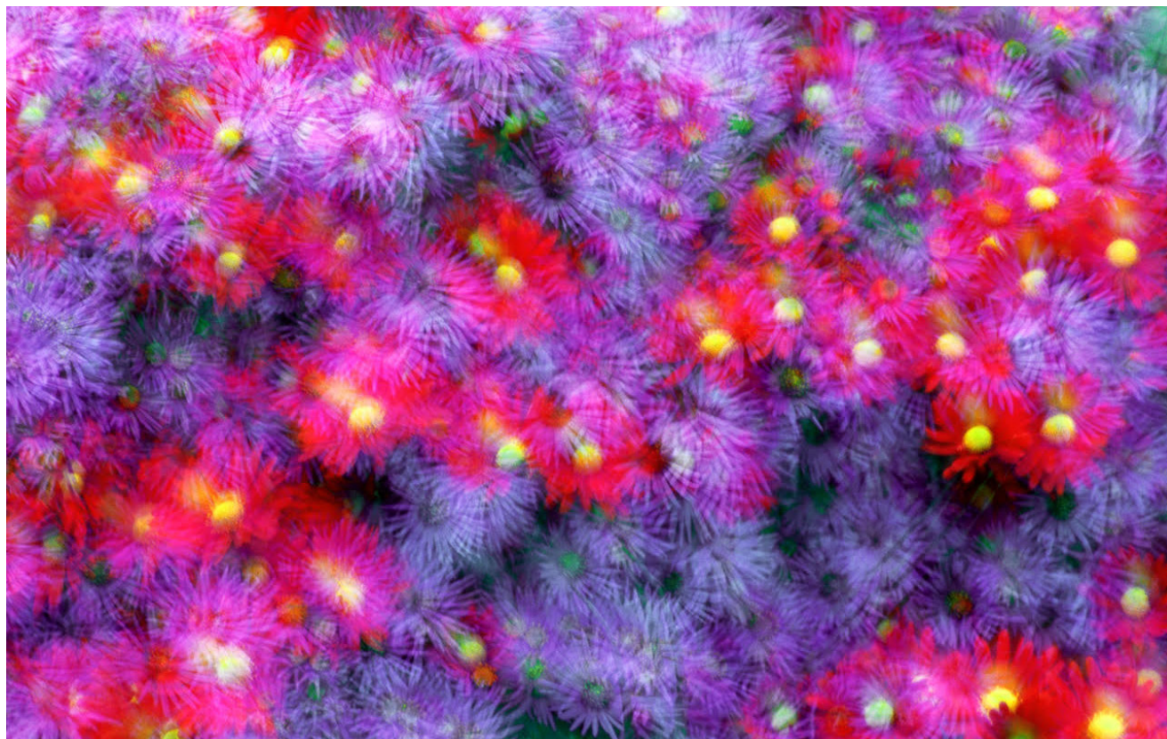
Chrysanthemums - Multi-exposure