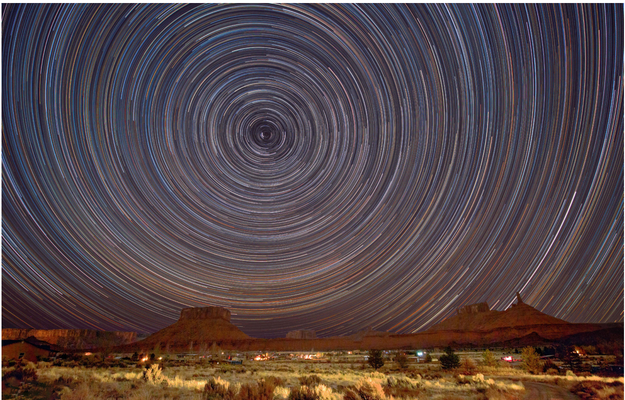
Star Trails Over Castle Valley