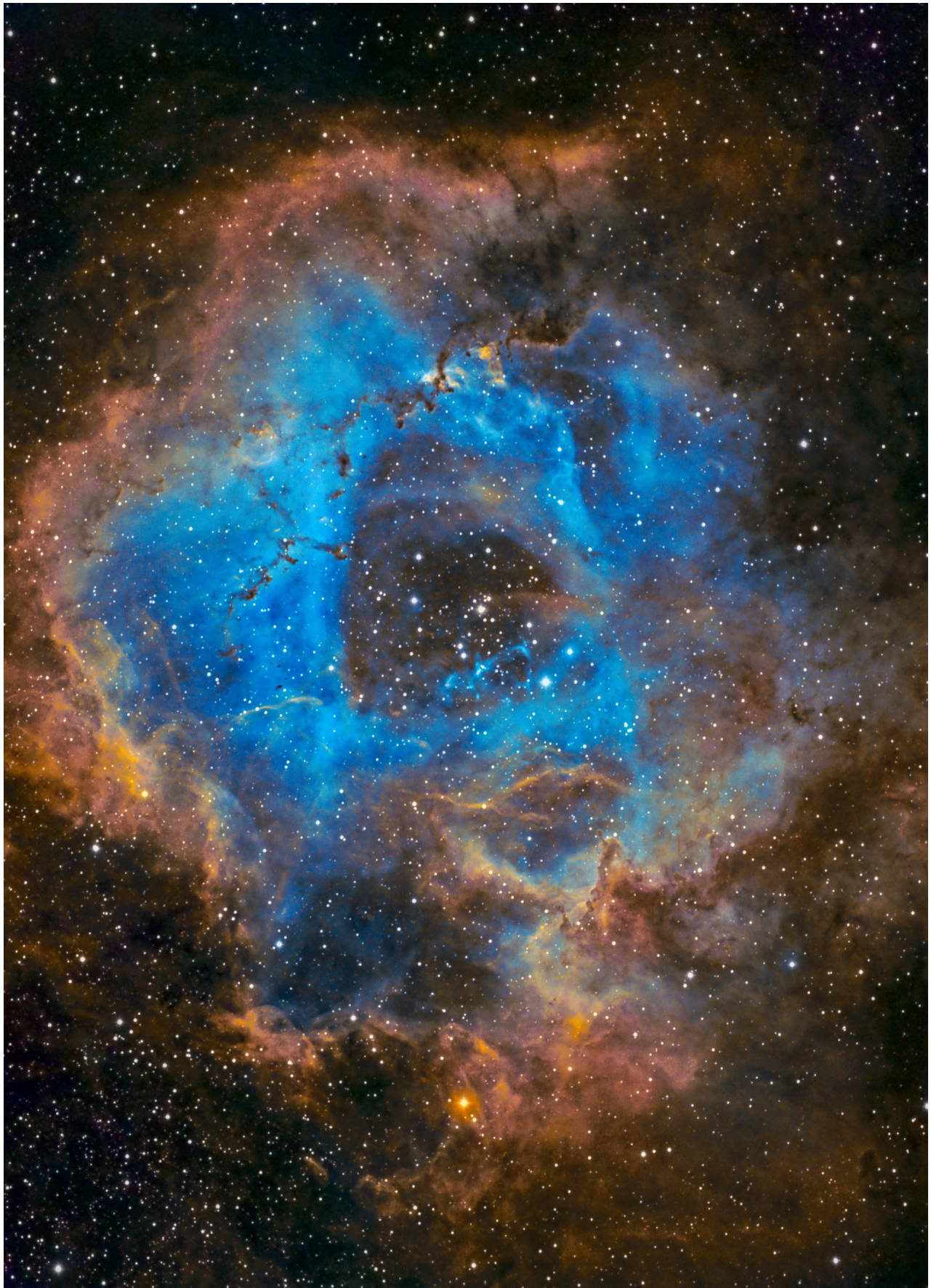
Rosette Nebula