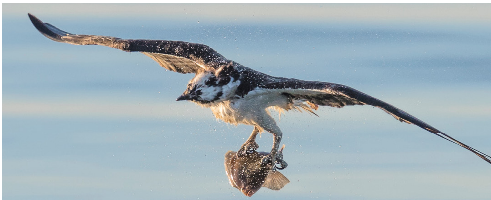
Osprey Shirring Water

Further examples of his work can be found on his website, http://marksethlender.com . Learn more about the National Wildlife Refuge System at http://www.fws.gov .