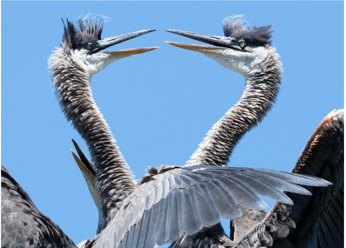
Great Blue Heron - Cain and Abel Reach an Understanding