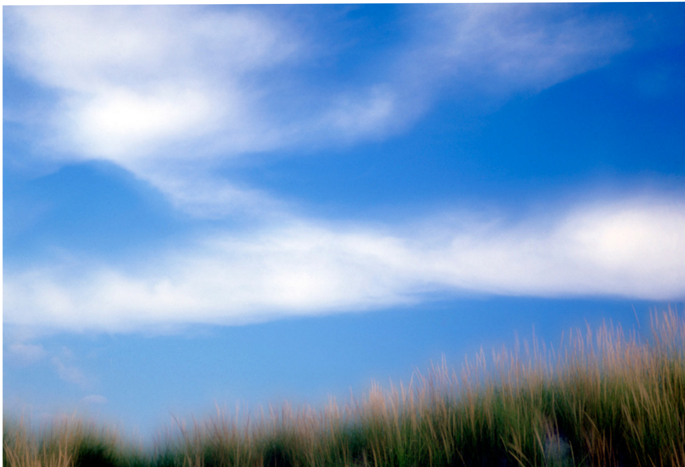
Clouds and Grass - Double Exposure