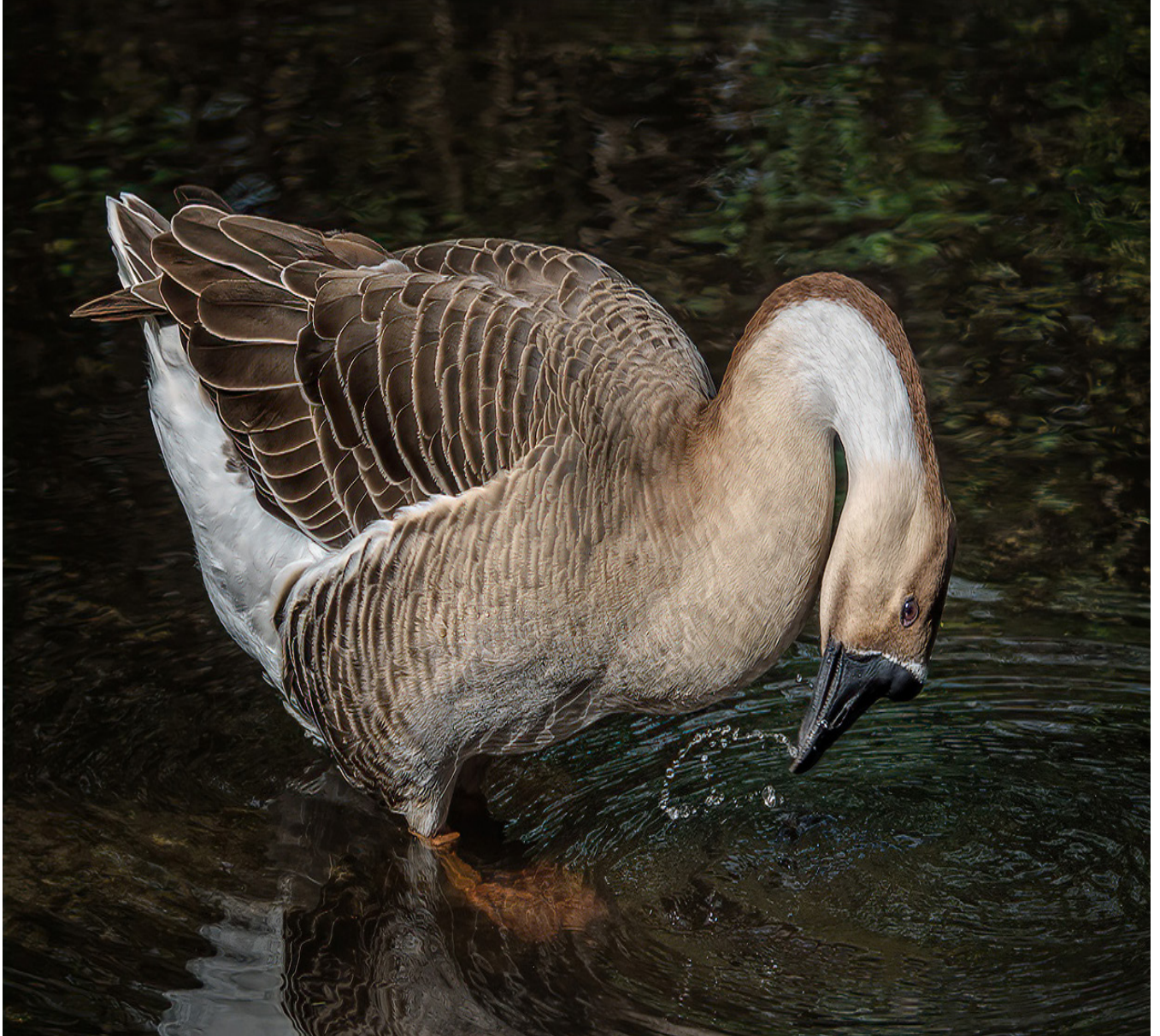
Graylag Goose © Helen Pine