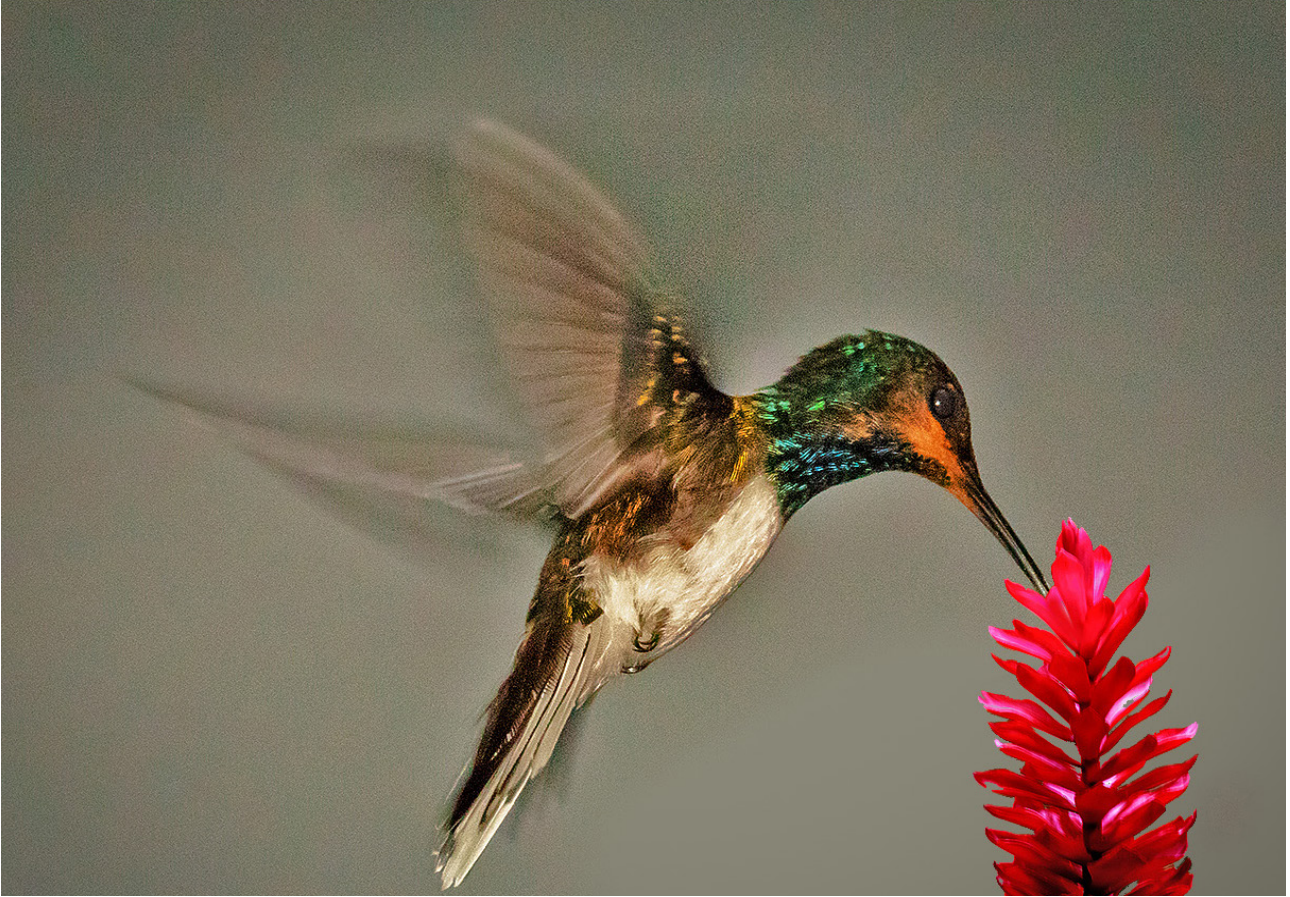
Hummer on Ginger