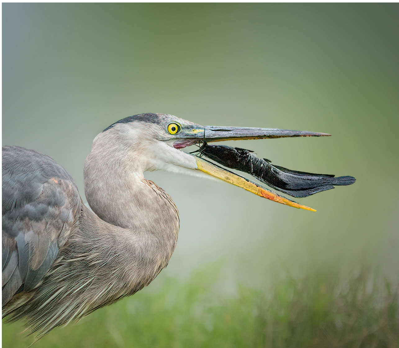
Great Blue Heron with Catfish