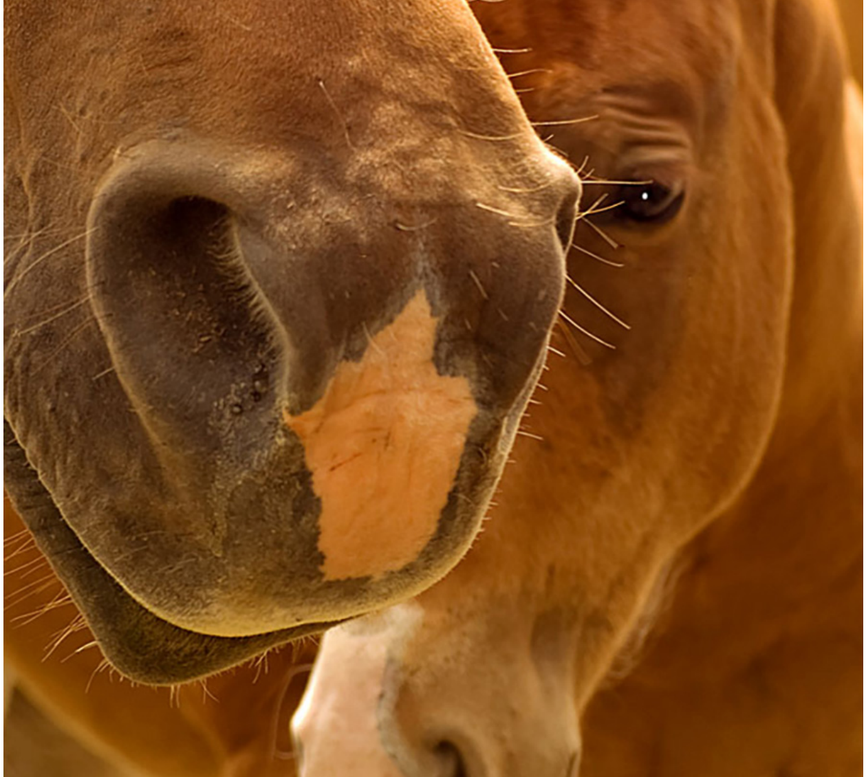
Peek-A-Boo Pony © Chuck Pine