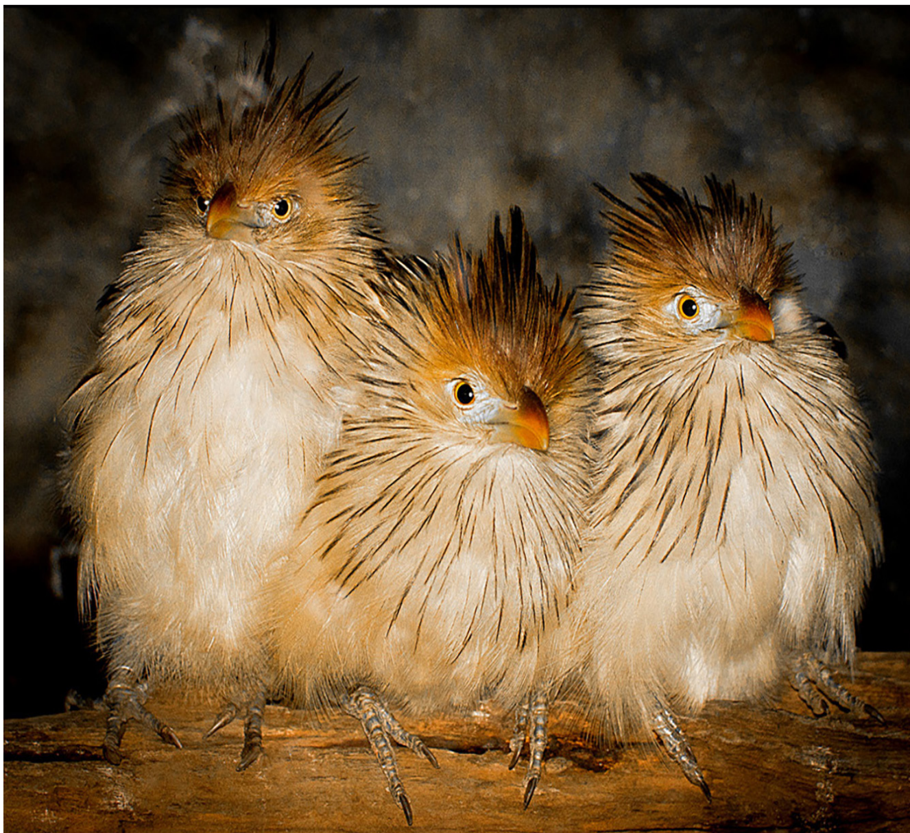
Three Chicks