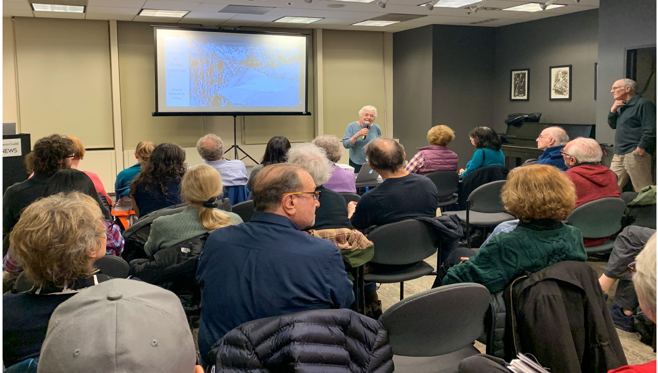
Member Meeting, January 2020