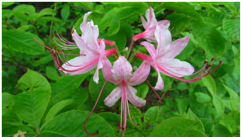
Pinkster Azalea, Clove Lake Park, Staten Island, May 2019

Louise Luger will have a photograph published in the 2020 Staten Island Nature and Wildlife Calendar, produced by Protectors of Pine Oak Woods , an organization dedicated to the preservation of wild habitats. Acceptance of this photo was through a juried competition. The photograph is a close up of a wild azalea, growing on the hills in Clove Lake park. These plants are part of the genus Rhododendron .