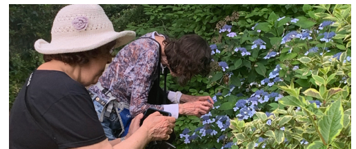
Members at Planting Fields Arboretum, June 2019